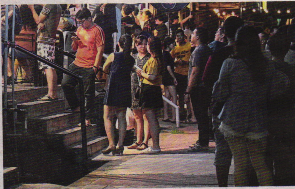
The main consumers of bubble tea are youth who should be mindful of the environment.

franchisees operate the business based on regulations set by the franchiser which requires them to use plastic cups and straws," she opined.