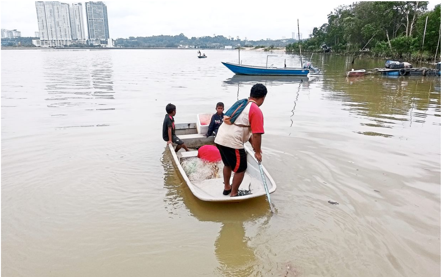
Orang Seletar villagers fishing in the waters off Danga Bay.

JOHOR BARU: Johoreans hope more people will play their part in protecting the environment as it is a shared responsibility.