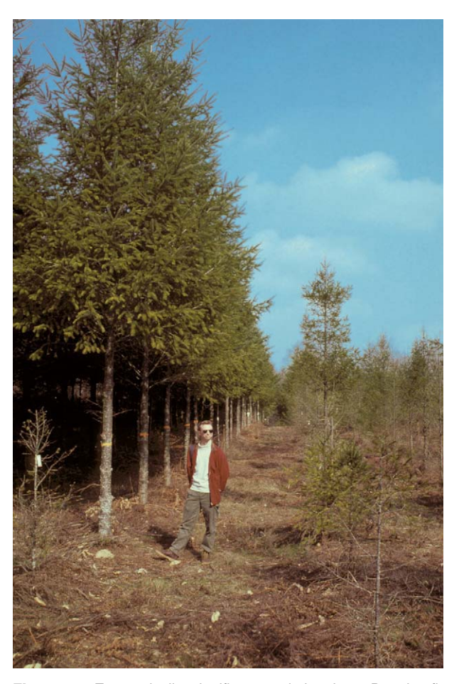
Figure 2 Economically significant variation in a Douglas-fir ( Pseudotsuga menziesii ) provenance trial, Limousin region, France. Trial age is about 10 years; the student stands between blocks representing an Oregon (background left) and northern British Columbia (foreground and right) provenances. The experiment was established by Office National des Fôrets.

The genetic gains achieved at these stages in most tree breeding programs have, almost invariably, been large and cost-effective; they are typified by Figure 2